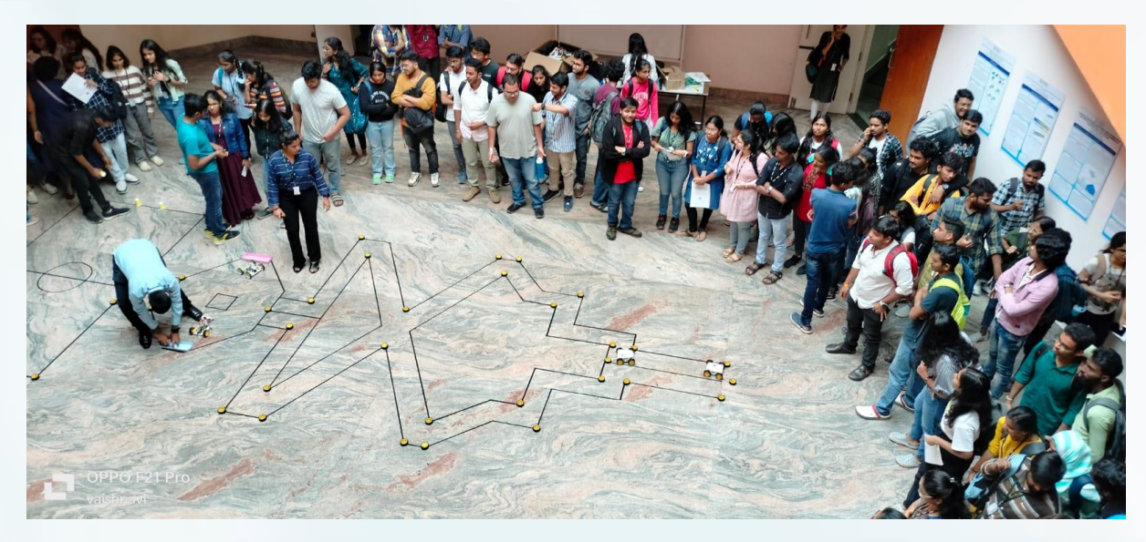
Yelahanka ComedKares team conducted an Induction program for BSc. honour students at Atria Institute of Technology.