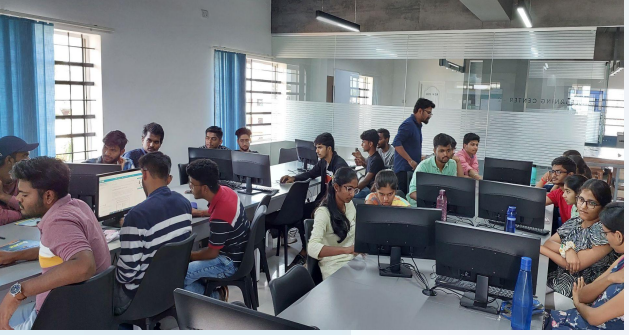
Students of KLS Gogte institute of technology and KLE Dr. M.S. Sheshgiri undergoing Robotic Course @ ComedKares Innovation Hub in Belgaum