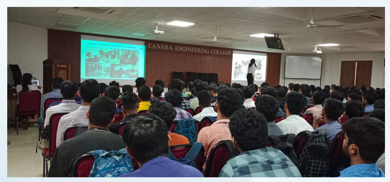
The introductory session on Robotic course was conducted at Canara College in Mangalore, where 300 students from different branches participated.