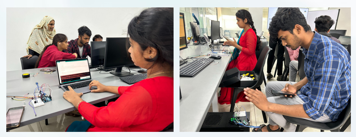
Students at Banaswadi Centre undertaking the Robotics Course

Towards the fag end of the year, ComedKares centers have been buzzing with hybrid and in-centre engagements. Our IDT and Robotics courses continue to be popular across the 8 regions. Notably, this month saw even more participation and accolades won by students, reinforcing the power of a supportive ecosystem in the successes of students in tier 2 and 3 regions. Our students continue to visit the centres post their programs, especially students who undertook the Social Connect Through Field Visit course and have also been applying for grants after their demo days. All in all, the month of December has been a springboard for student aspirations, with continued engagement fostering a sustainable ecosystem of learning and collaboration.