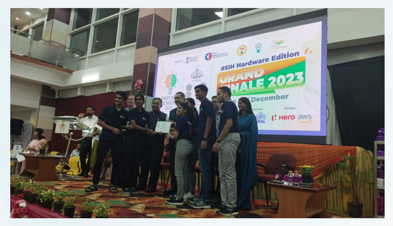
NIE College's First-Year Team Makes Big Waves at Smart India Hackathon, Bringing Home 3rd Place with Innovative Smart Toilet Development. This achievement marks a significant milestone for NIE College since its collaboration with the Mysore ComedKares Innovation Hub.