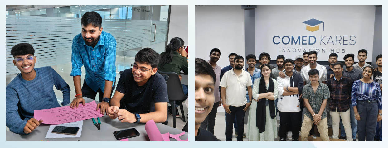
Students at Yelahanka Centre undertaking the IDT Course