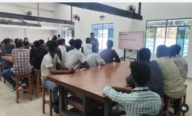
Students of NIE Colleges undergoing Innovation and Design Thinking Internship at ComedKares Innovation Hub@ Mysore Centre